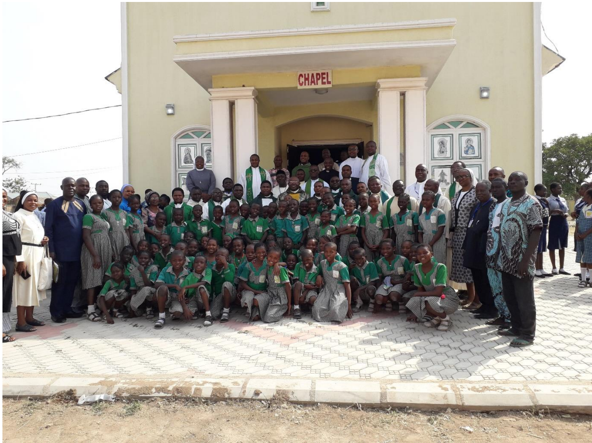
Group photograph with some students after the last mass of the Jalingo 2020 Convention