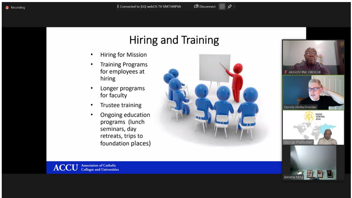
One of the slides on the approaches to running a Catholic University