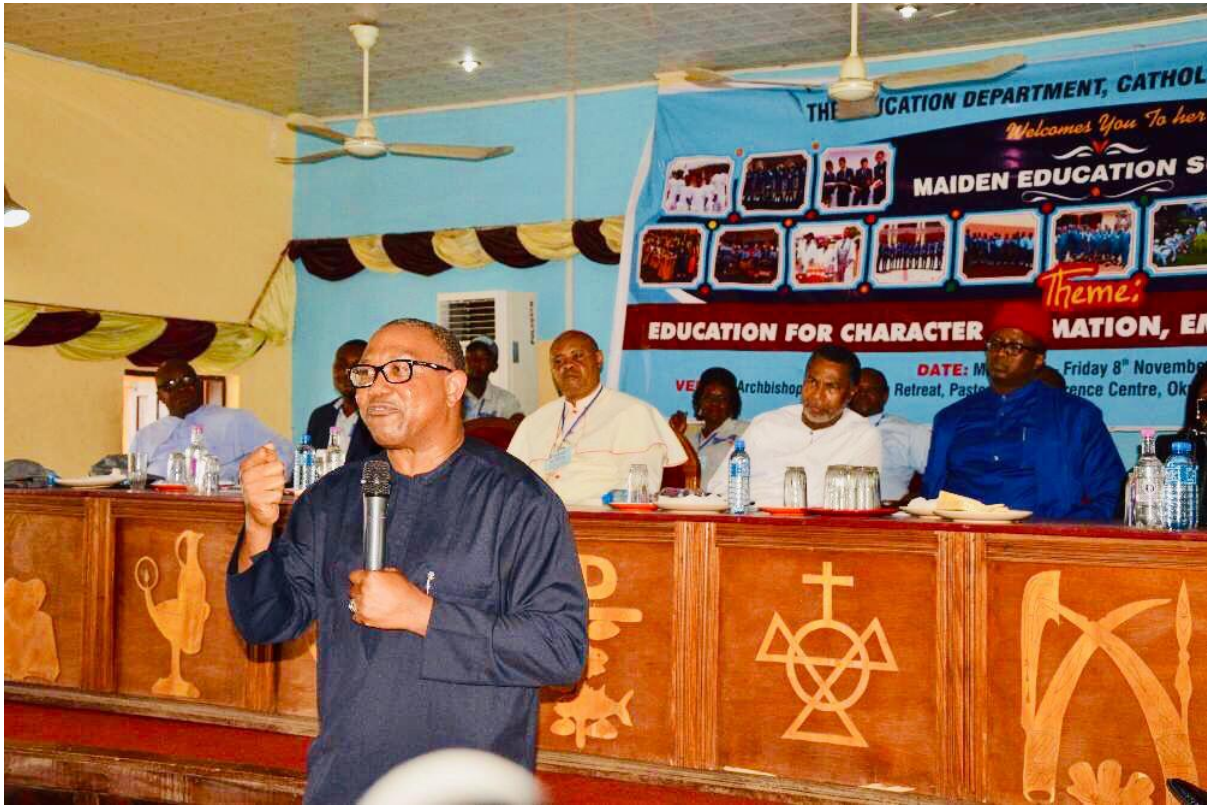
Sir Peter Obi, the former Governor of Anambra state, speaks at the Awka diocesan Education Summit